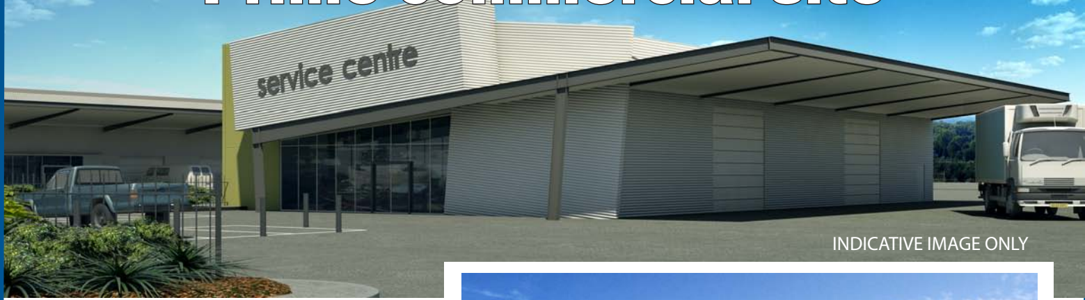
INDICATIVE IMAGE ONLY